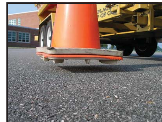
The cone hangs – waiting to be dropped on the road as you drive along. A simple button press drops the cone where you want it. The "hang height" is adjustable to accommodate road conditions and trailer hitch heights.