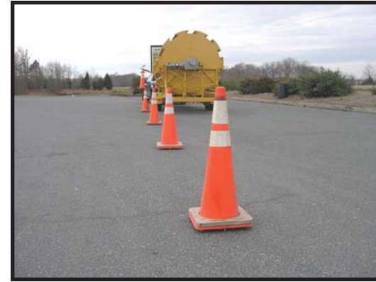
130 cones will cover 1 1/4 miles at 50' spacing or 2 1/2 miles at 100' spacing.