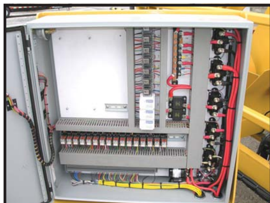
We designed the machine using interchangeable components. Troubleshooting the machine is done with a simple 12v test light.