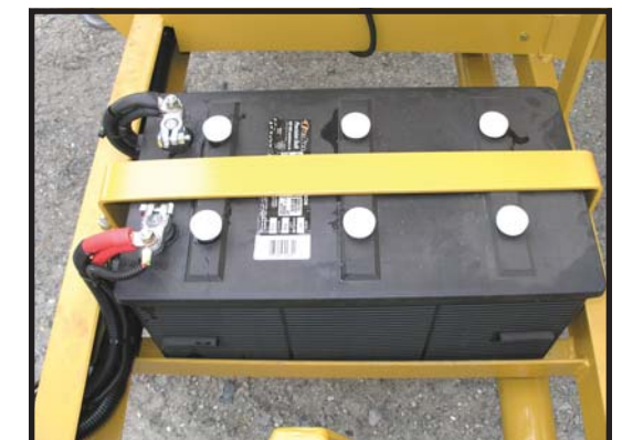
The machine operates on 12vdc power. The batteries shown allow the trailer to be totally self contained allowing any available truck in the fleet to do the job.