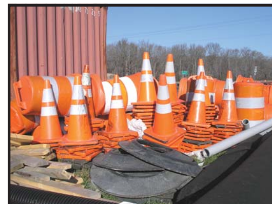
This pile of cones costs well over $1000 and is a tempting target for theft. Our machine stores the cones, prevents theft, and saves the labor of constantly loading and unloading cones from trucks.