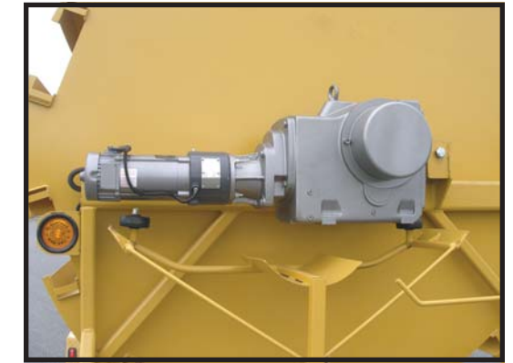
The entire cone storage drum rotates as needed to supply or retrieve cones. This rugged heavy duty gearbox handles the job with ease.