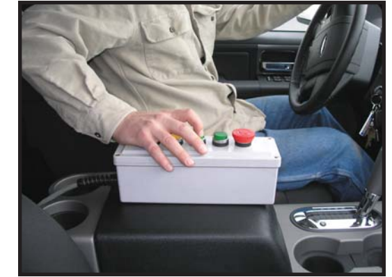
The driver controls the machine using simple controls, usually just one button push per cone. Our AUTODROP option measures and automatically drops cones at your preset spacing.