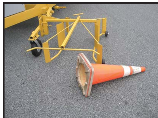
The machine will pick up cones that are still standing, or have been knocked over. The guide positions and feeds the cone where it is needed.