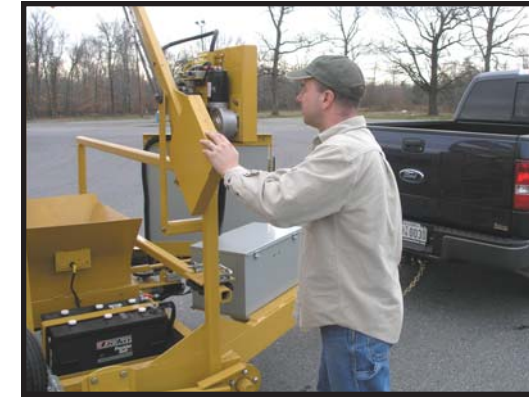
The machine will place and pick up cones from either side of the trailer. Moving from one side to another is simple and takes seconds.