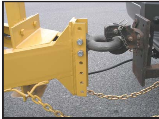
The hitch easily converts from pintle ring to ball, and provides generous height adjustments.