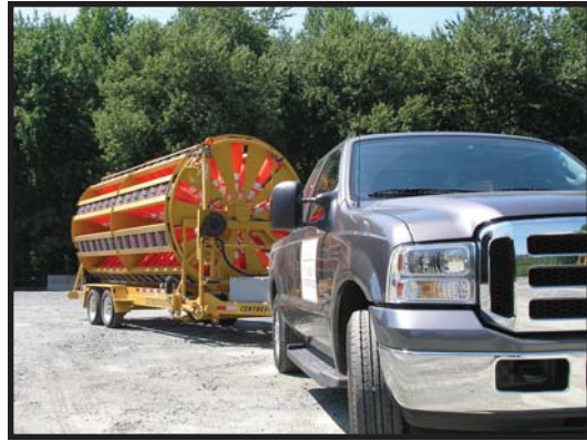
The machine tows using a 3/4 ton pickup truck. No modifications are required on the truck.