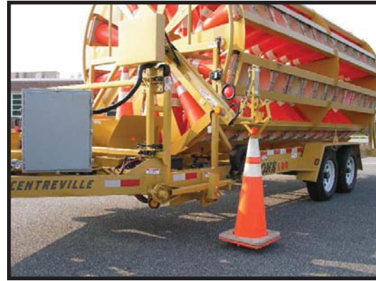
The machine holds 130 standard 36" cones with base weights attached.